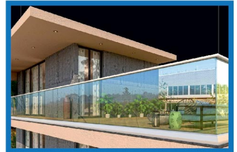
□ Modular Glass Railing