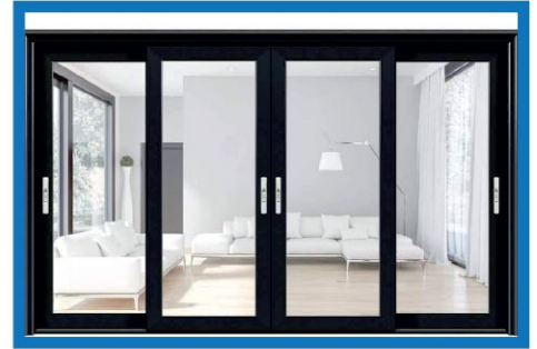
□ System Aluminium Windows & Doors