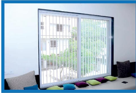
□ Conventional Aluminium Windows