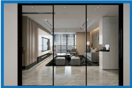
□ Ultra slim Aluminium Windows