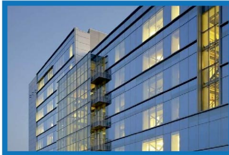
□ Glass Facade & Glass Work