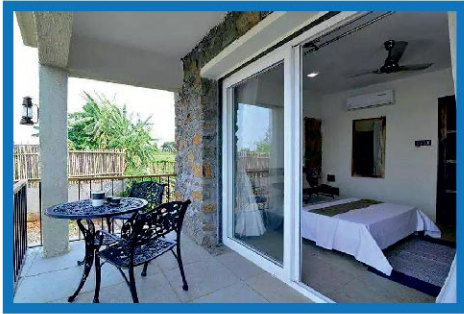
□ uPVC Windows & Doors